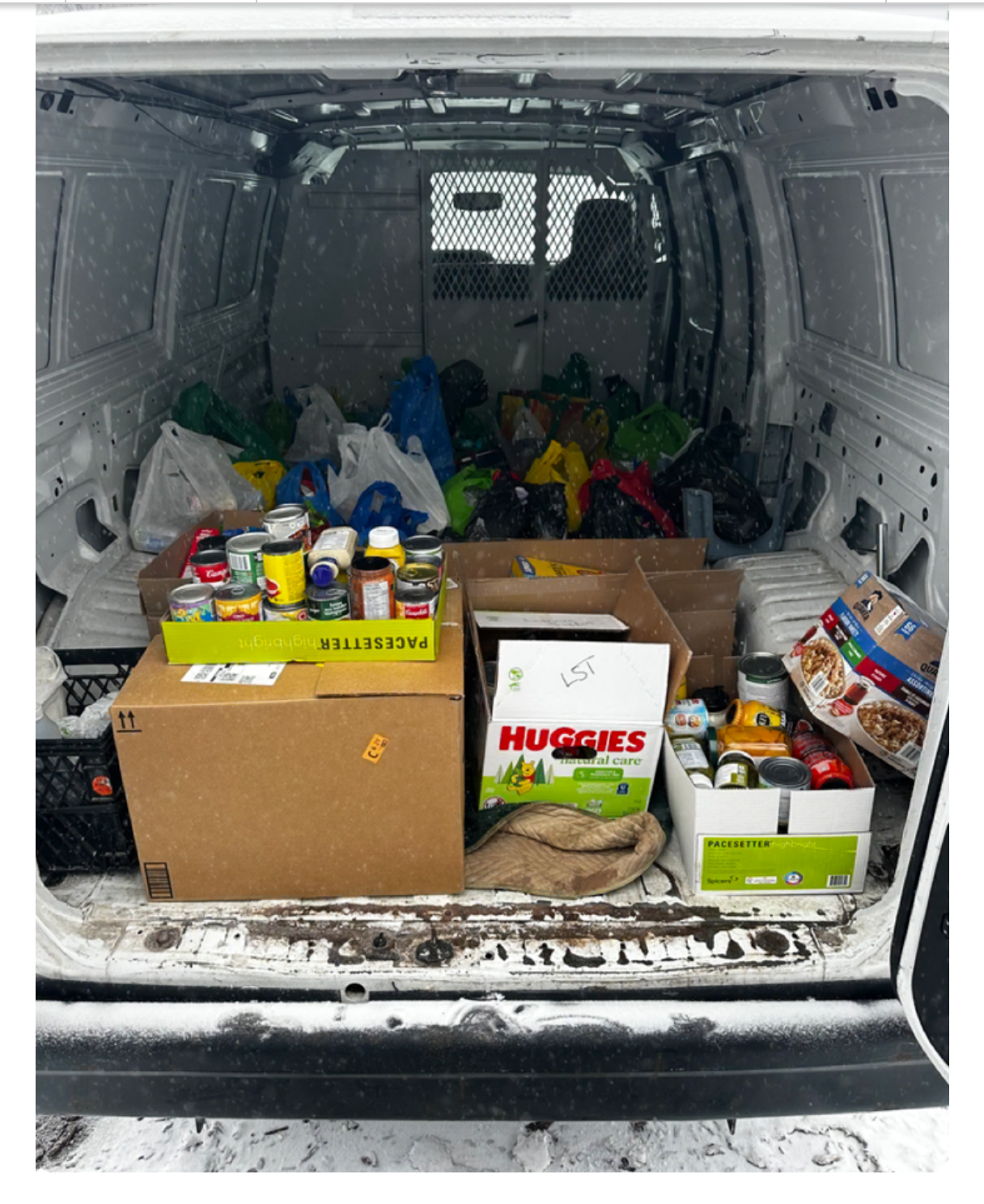
January Food Drive

Thank-you so much for your generous donations to the Airdrie Food Bank! You have made a difference for so many local families!