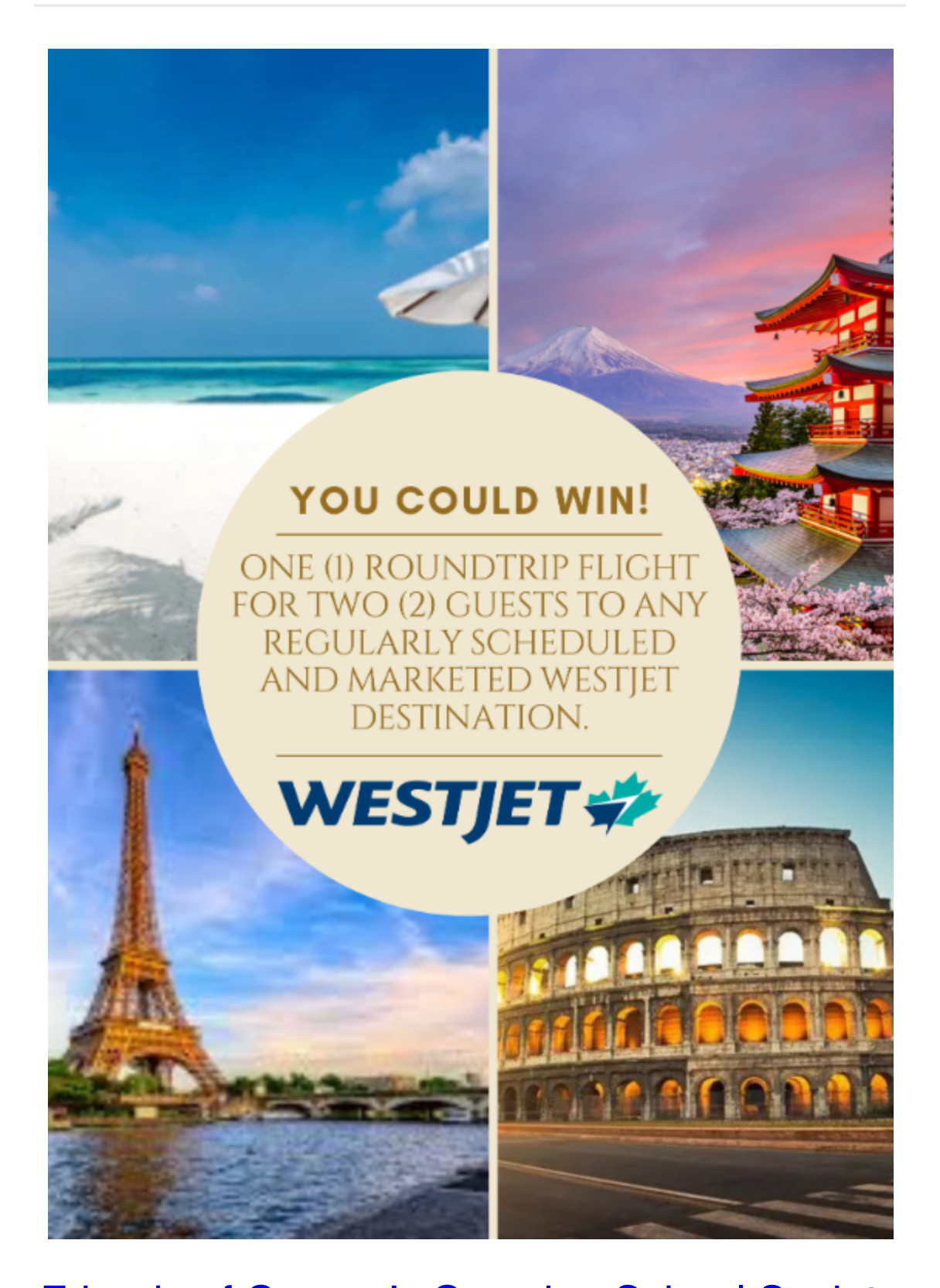
Friends of Cooper's Crossing School Society